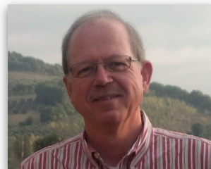
Tom Little Missions Committee